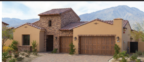
Romanesque - A