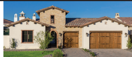
Mediterranean Revival - B