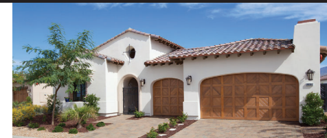
Spanish Colonial - C