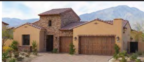
Romanesque - A