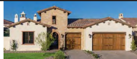
Mediterranean Revival - B