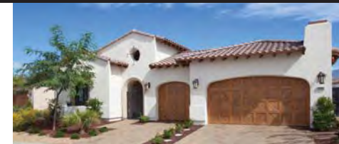
Spanish Colonial - C